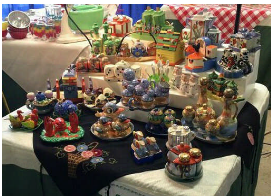
SPICE OF LIFE CONDIMENT SETS—CAROLE BESS WHITE