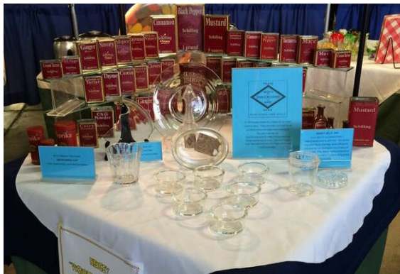
HEISEY VISIBLE COOKWARE—DENNIS HEADRICK