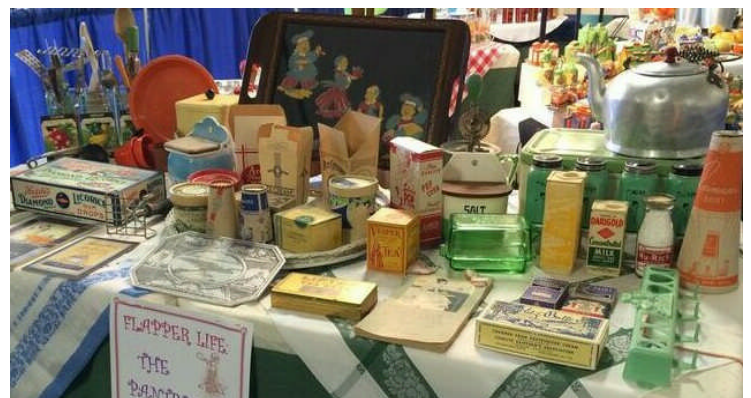
FLAPPER LIFE: THE PANTRY—CAROLE BESS WHITE