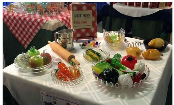
WHAT'S FOR DINNER?—MABLE HARDEBECK