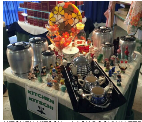
KITCHEN KITSCH—JACK BOOKWALTER