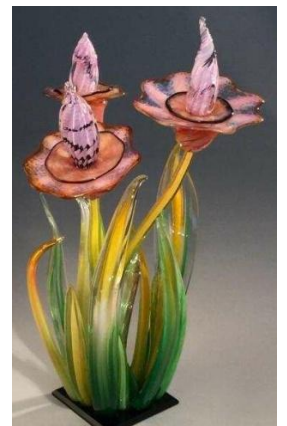
GLASS SCULPTURE BY RANDY STRONG

654 BELLA VISTA PLACE, GRESHAM, OREGON, 97080-6526