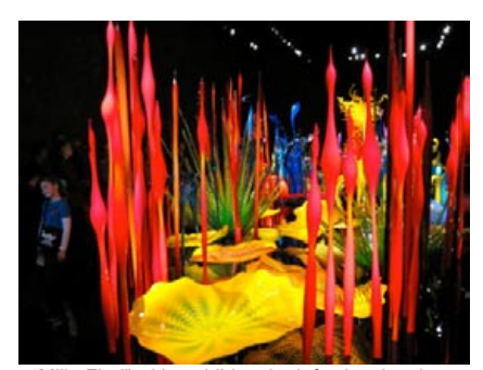
"Mille Fiori" with a child to the left, showing the scale of the piece-Neal Skibinski