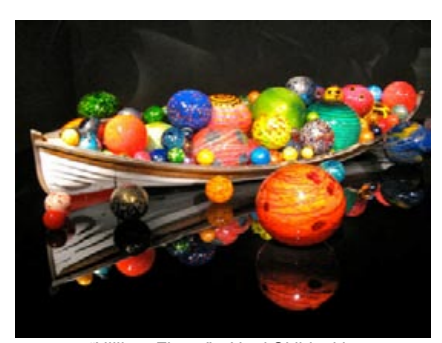
"Niijima Floats" – Neal Skibinski