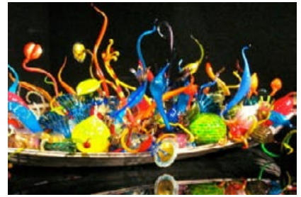
"Ikebana Boat" –Neal Skibinski