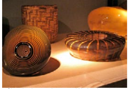
Glass baskets and an actual Native American basket in the Northwest Room – Neal Skibinski