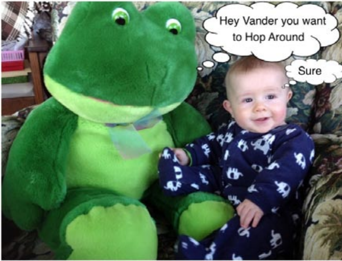
Proggy makes a great babysitter